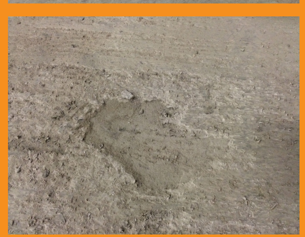
The project called for a specialist, failsafe flooring solution, capable of going over a weak substrate covered with latex, adhesive residue and wet areas.