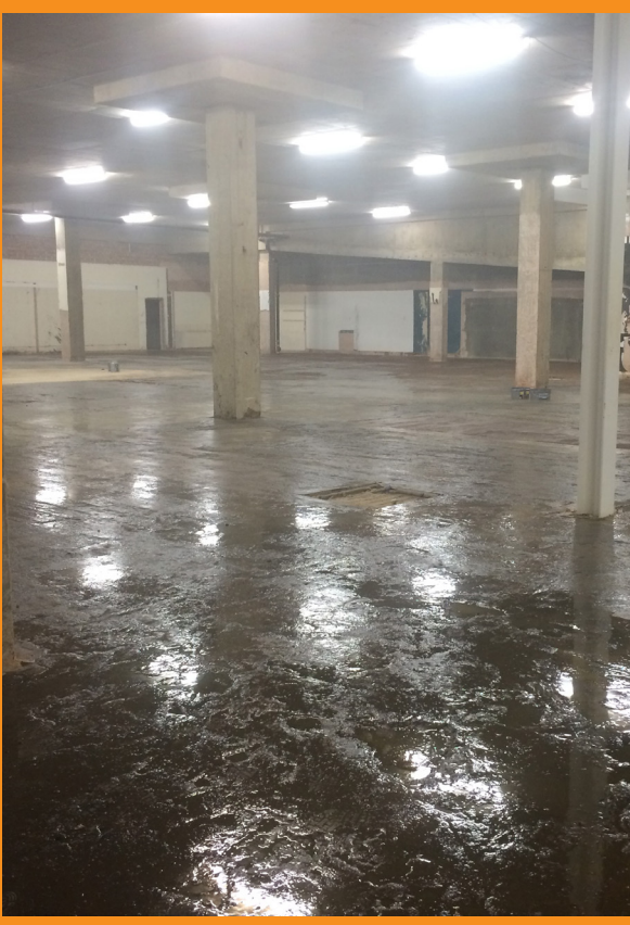
Uzin's PE 480 DPM was applied to the ground floor