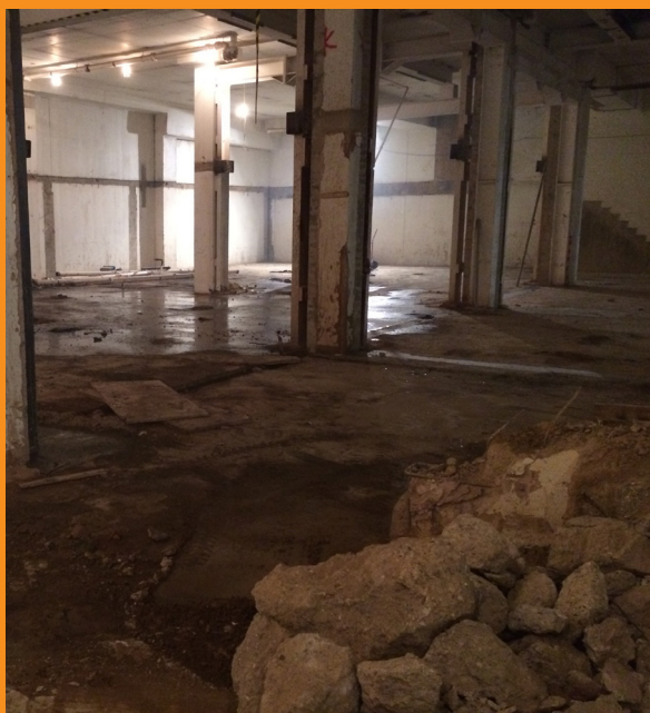
Leaking pipes and water ingress posed constant problems throughout the installation process.