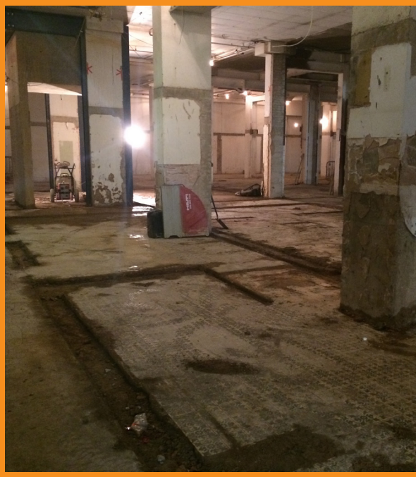
Level differences and channels in the existing floor called for a high level of preparation.