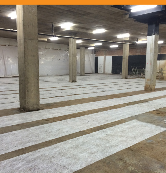
Mesh was rolled out and Uzin NC 160 pumped in