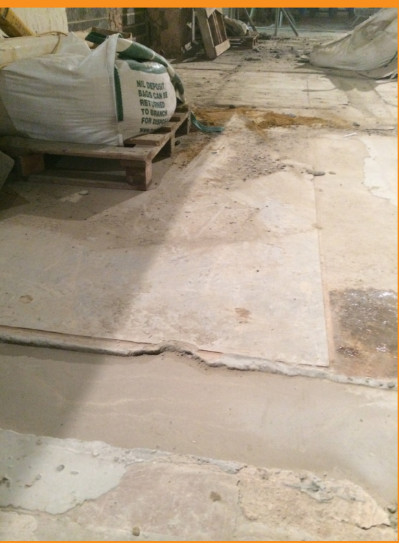
Channels were backfilled and level differences ramped down.