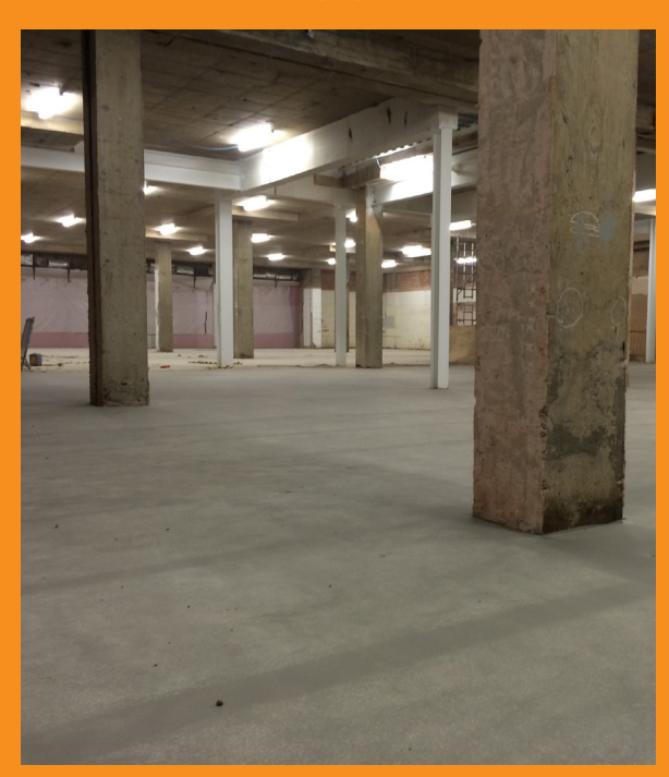
The finished floor for Area 1.