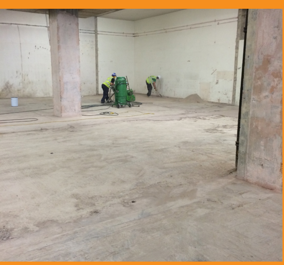
Existing state of the screed was extremely poor