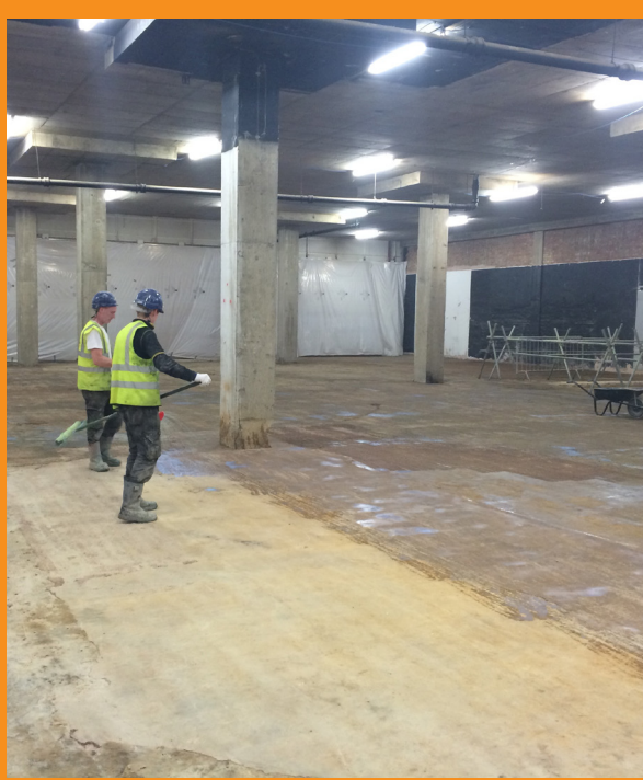
Uzin's PE 360 primer was applied to the first floor.