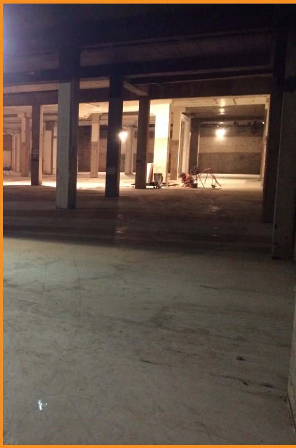
The finished floor for Area 2